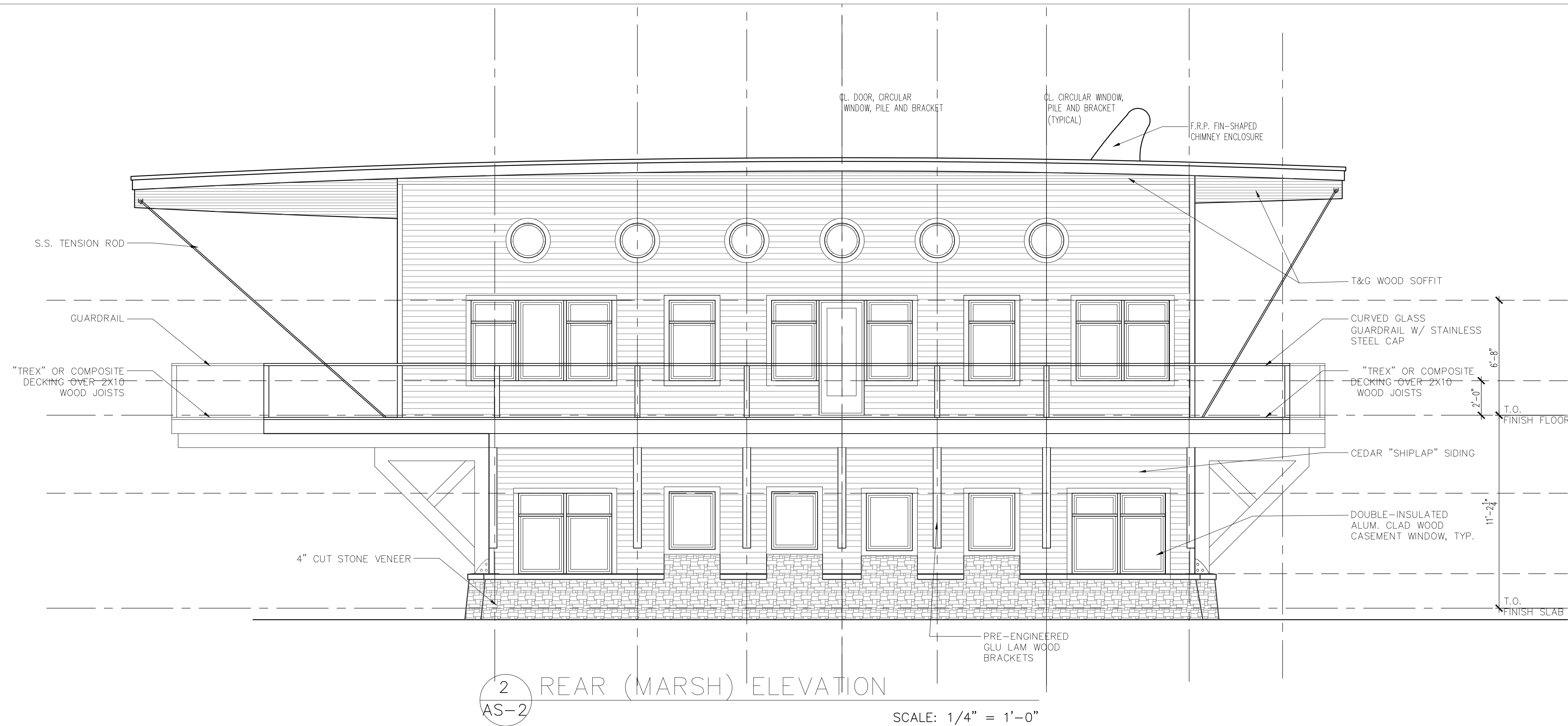
2 REAR (MARSH) ELEVATION AS-2